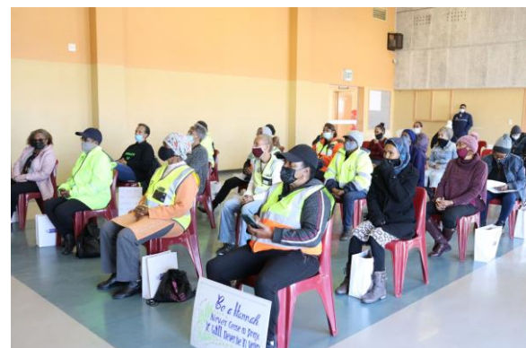
▲ Participants of the Women's Day walk about.