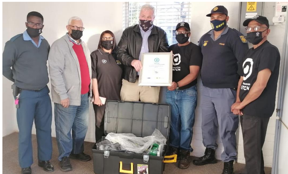
▲ Members of the Weltevrede 2 NHW with their accreditation certificate on 28 September 2021.