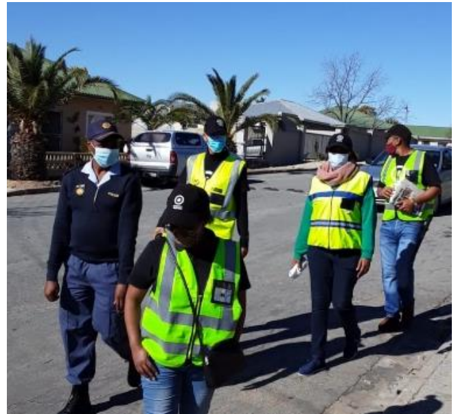
▲ The Piketberg NHW pictured at the patrol that took place on 17 July 2021.