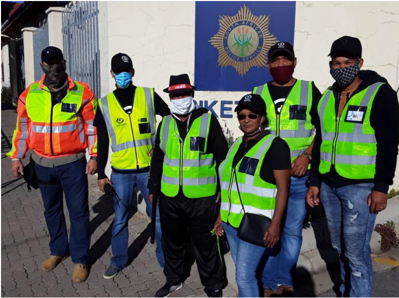
▲ The Piketberg NHW regularly goes on patrol with members of SAPS and law enforcement where they are involved in patrols at the taxi rank, shops and roadblocks. They also request the public to wear their masks and adhere to social distancing. This photo was taken at the patrol that took place 17 July 2021.