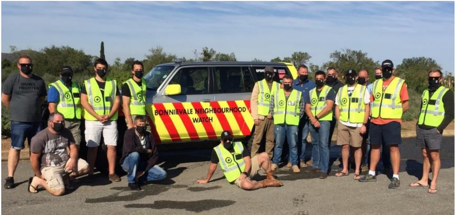
▲ The Bonnievale NHW team with their patrol vehicle.

The Bonnievale NHW was registered on 17 February 2021. We started out with nine patrol members who used their own vehicles. We now have 32 members. The members would be booked at the local police station pre-patrol and we would receive an OB number for the particular patrol. We would then record in our "Patrol register" with the time of the shift as well as the names of the patrol members.