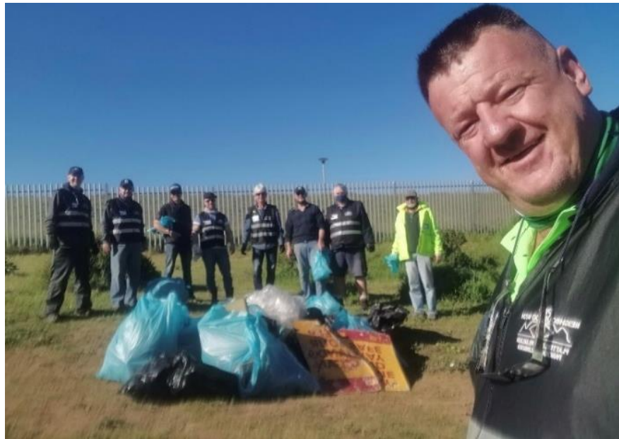
▲ The PWP team that was involved in the cleanup on 25 August 2021.