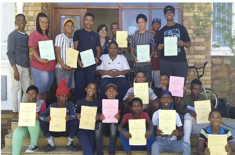
▲ The Klaarstroom NHW hosted a Victim Empowerment workshop for the youth of the community.

We want to thank all NHW members for their loyalty and perseverance. They are indeed a group that will take crime prevention to the next level. I also want to thank the family members of these NHW members for lending them to us to make a difference in the community.