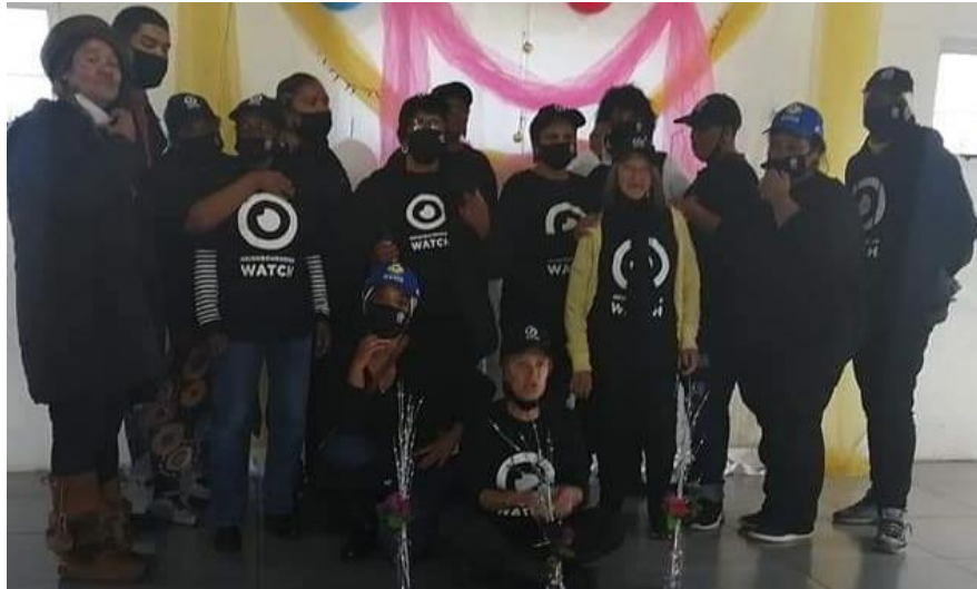
▲ The members of the Resident's Watch NHW in Pelican Park at the Women's Day brunch on 9 August 2021.

On 9 August 2021 Resident's Watch NHW based in Pelican Park hosted a Women's Day brunch and information session. The event was sponsored by City of Cape Town, Classic Meat and Standard Bank. Their support contributed to the success of the event.