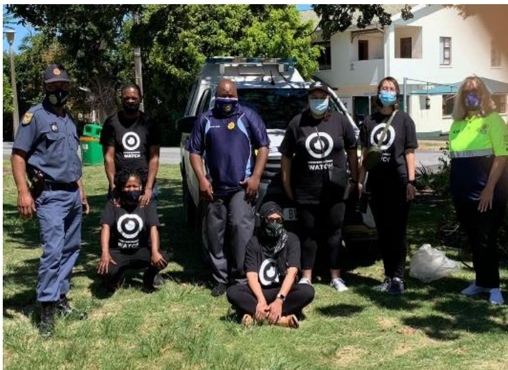
▲ The NHW cellphone handover which took place in Knysna on 5 December 2020.