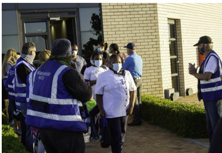
▲ The Table View NHW members honouring and thanking healthcare workers for their dedication during the COVID-19 pandemic at the Netcare Blaauwberg Hospital on 28 January 2021.