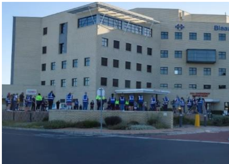
▲ The Table View NHW gathering outside Netcare Blaauwberg Hospital on 28 January 2021.

"By now, we all know someone fighting Covid or somebody who has lost someone fighting Covid-19 - our healthcare workers across the country are drowning in it daily. A small gesture such as this one goes a long way in keeping their spirits up. They can't get away from it, they are our superhero's!" said Laura Outhet of the TVNHW.