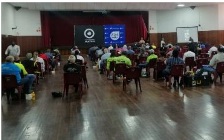
▲ The NHW cellphone handover which took place in Goodwood on 28 November 2020.