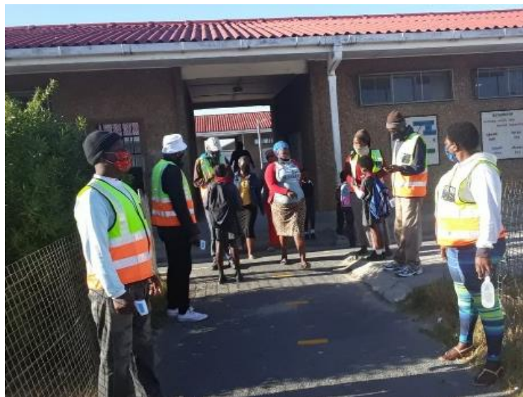
◀ At the commencement of school on 15 February 2021, the Zero Crime NHW from Khayelitsha volunteered at Kukhanyile Primary School with ensuring that all COVID-19 protocols were followed.