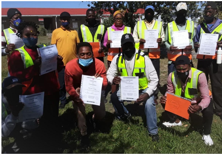
◀ The members of Zero Crime NHW receiving their certificates of participation following their successful completion of the AVP workshop on 19 March 2021.