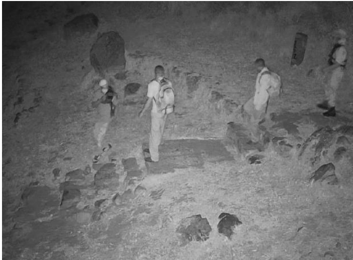
▲ Four men triggered the firebreak camera at 27 Berg Road on 28 December 2020.

Action was taken following an increase of home robberies and attacks taking place in homes alongside the firebreak in Simon's Town, Kommetjie, Fish Hoek and Glencairn.