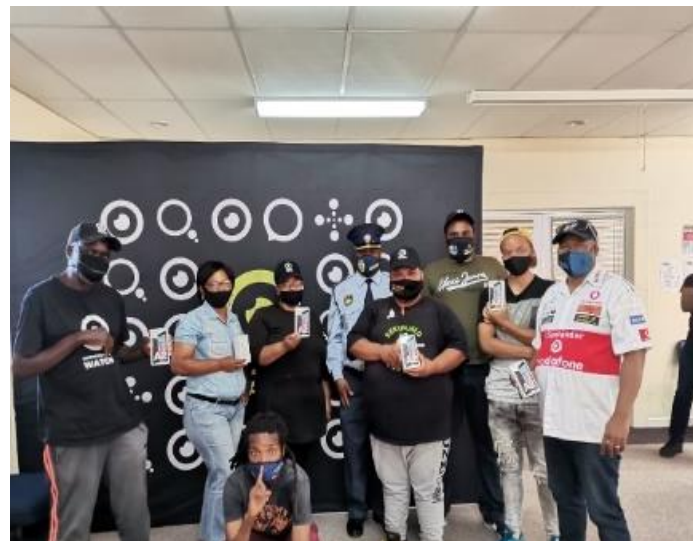
▲ The NHW cellphone handover which took place in Beaufort West on 4 December 2020.