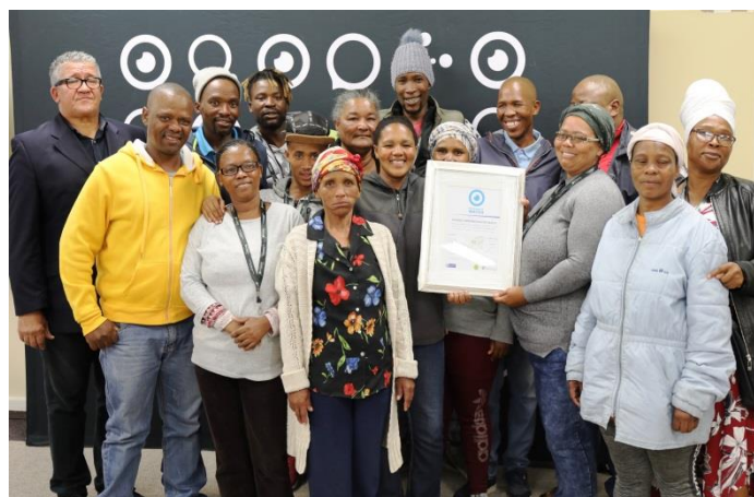
Hillside 2 NHW receiving their accreditation certificate at the NHW Brand Launch on 16 March 2020.