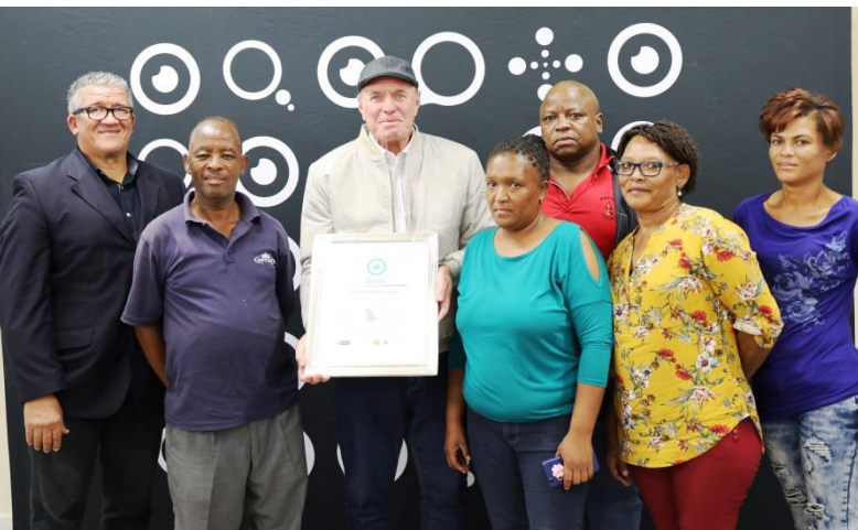
Lande NHW receiving their accreditation certificate at the Beaufort West Brand Launch on 16 March 2020.