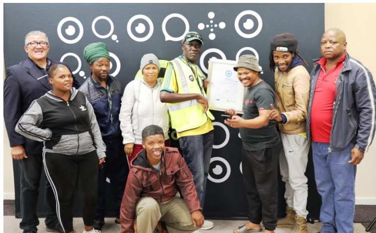
Graceland NHW receiving their accreditation certificate at the Beaufort West Brand Launch on 16 March 2020.