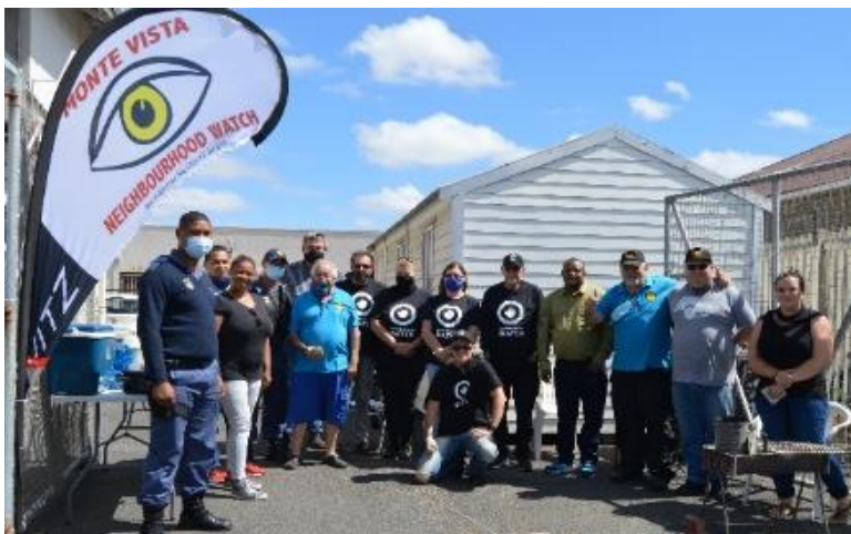
◀ Members of various NHWs, Goodwood CPF and Goodwood SAPS during the appreciation lunch.

The Monte Vista Platteklouf Glen Neighbourhood Watch (NHW) joined up with the Goodwood Community Police Forum in providing members of the SAPS Goodwood Station with boerie rolls for lunch. This Goodwood CPF initiative was a network building exercise and an opportunity to thank SAPS for their public service (especially during the COVID-19 pandemic), as well as meeting some of the staff face to face. A very positive and heartwarming appreciation was received from all the SAPS staff on duty. Together with the Monte Vista Platteklouf Glen NHW as well as the Tygerdal Neighbourhood Watch NHW and the Goodwood CPF, it is planned that this initiative will be held on a quarterly basis.