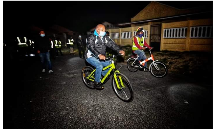
▲ Mayor Dan Plato on patrol with the Eerste River Sector 4 NHW on 4 June 2021.