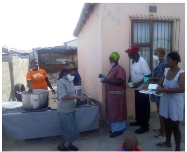
▲ Siyaphambili NHW also runs a soup kitchen for the elderly and children, which has greatly assisted the community during the COVID-19 pandemic.