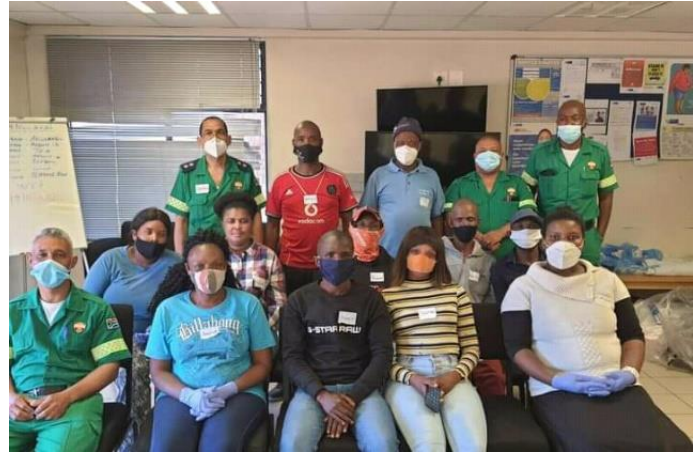
▲ During April 2021 the Siyaphambili NHW attended the Emergency First Aid Responder training course offered by the Department of Community Safety (DoCS) to accredited NHWs.