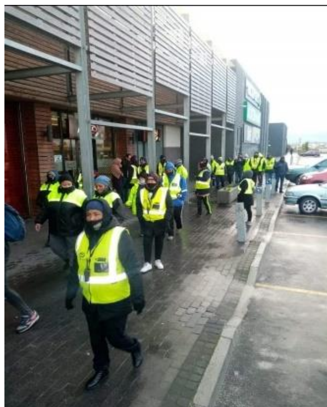
▲ Members of the Echo and Extreme NHWs from Delft out in full force, patrolling their local shopping outlet.