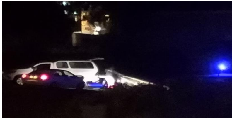
▲ The Port Owen E-Watch nabs illegal fishermen in their community.

The Port Owen E-Watch shut down an illegal fishing operation during May 2021. Our night patrollers noticed suspicious behaviour in the canal feeding into the marina. The patrollers alerted the E-Watch group via radios and WhatsApp. The Marine Rangers and SAPS were also immediately contacted, and the illegal fishermen were caught red-handed and apprehended. The Marine Rangers and SAPS confiscated two gill nets that will be used as evidence in the upcoming court case. A successful outcome for the community of Port Owen!