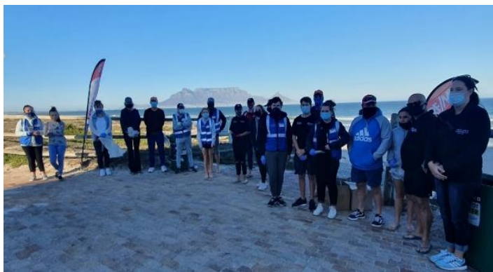
▲ TVNHW gathered for a beach cleanup at Blouberg Beach on 1 May 2021.

On 18 April 2021, Table View Neighbourhood Watch (TVNHW) made an urgent plea to the community for supplies to aid the firefighters who were battling the massive blaze above the University of Cape Town, which later spread to Walmer Estate and Vredehoek. The greater Table View community responded in full force. Over three days at least two loads of much needed supplies were dropped off per day. TVNHW would like to extend a MASSIVE thank you to ALL who supported the call for resources during this tragedy. We are incredibly proud of this community who pulled together