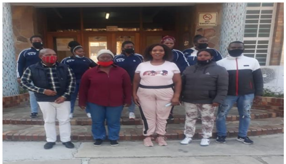
▲ The Sinegugu NHW of Khayelitsha attended their basic NHW Training at the Chrysalis Academy from 19 to 20 June 2021.