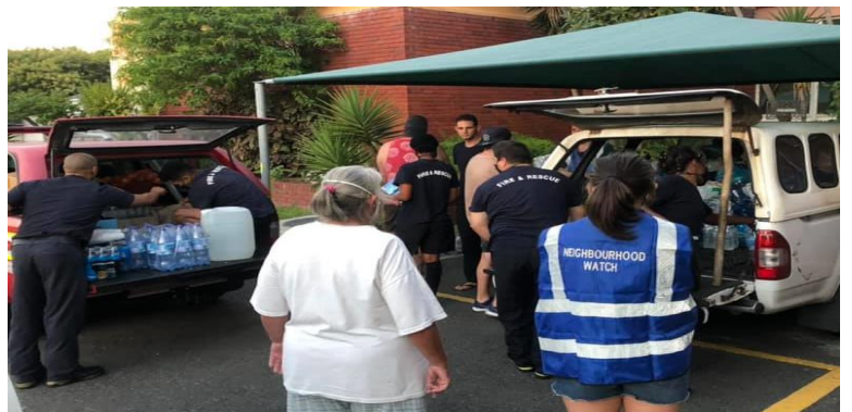
▲ TVNHW delivering much needed aid to firefighters during the April fires on 18 April 2021.

On 1 May 2021 TVNHW Yankee members organised a beach cleanup in conjunction with RE/MAX Property associates and Gregory Player from Cape Town Beach Clean/Clean C. The volunteers and members of the public collected a total of 26 bags of litter from Blouberg Beach.