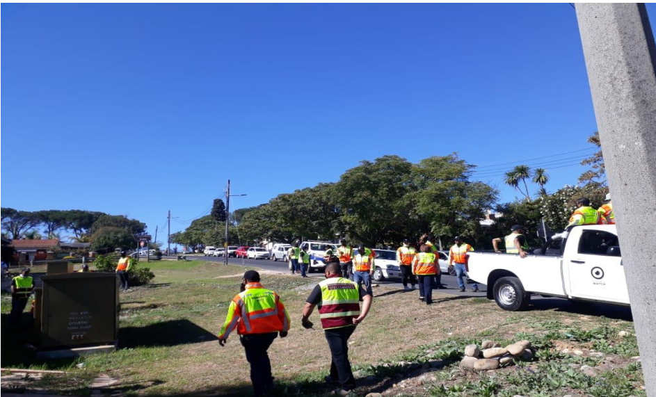
▲ The patrol driving through the communities of Cloetesville and Idas Valley to create community awareness on 1 May 2021.