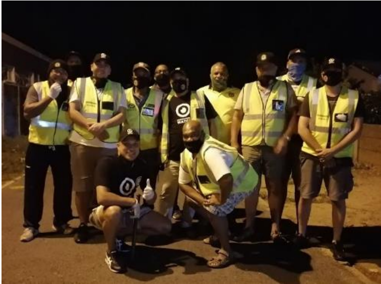
◀ The Bloomsbury NHW from Paarl East on an evening patrol.

The Bloomsbury NHW in Paarl East was established in 2015 after the criminal activity in the area increased. Crime has decreased dramatically since the establishment of the NHW and the community becoming active on platforms such as WhatsApp. NHW members do daily vehicle patrols to create a safer community for all. These patrols are very successful and over the year's various items such as knives, drugs and weapons have been confiscated.