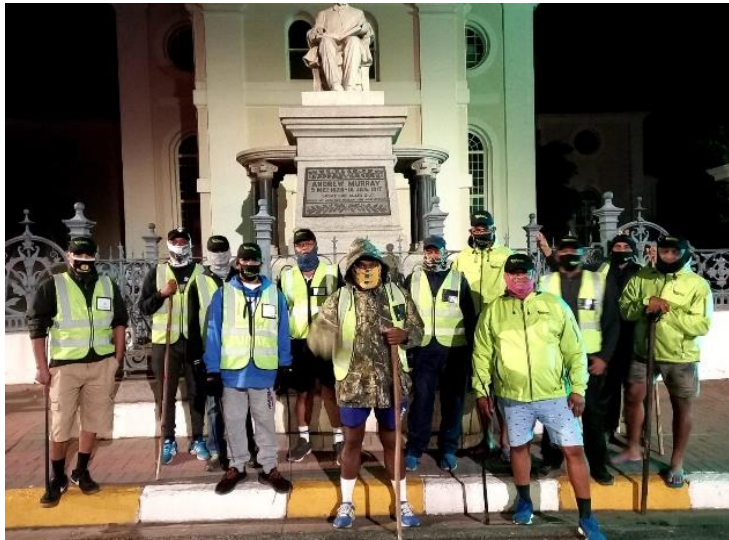
▲ The Voordorp NHW first official group photo taken at historical statue of Andrew Murray in Wellington. The NHW was accredited by the DoCS in February 2021.