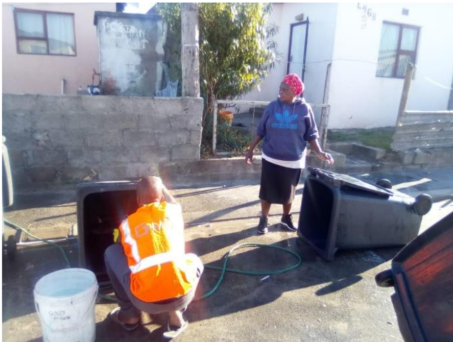
▲ In May 2021 the NHW started washing the municipal bins after solid waste collection on Wednesday's, in an effort to keep the community clean.