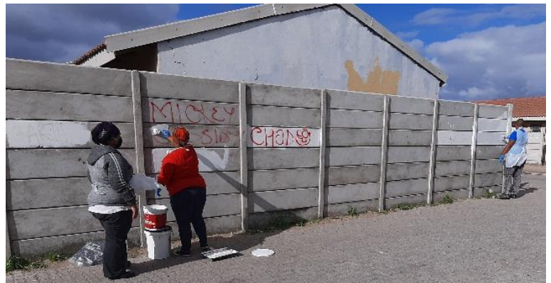
▲ Kaylin Blaauw, Renash Blaauw and Jade Baartman painting over graffiti.

We believe in the Broken Windows Theory because it makes so much sense. Simply, when you see signs of disorder do something about it. You need to be proactive and take action before it becomes by-law driven crimes. Criminal activity more frequently occurs in run-down areas where illegal dumping and graffiti are common. Our cleanup projects such as creating a community garden and painting over graffiti, also help to drive away the criminal element.