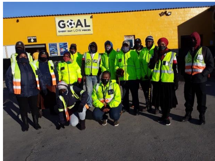
▲ Members of the Vukusebenze, Limikhaya and Ikamvalethu NHWs from Khayelitsha out in full force, patrolling their local shopping outlet.