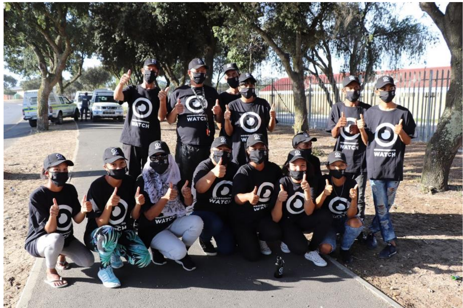
▲ Members of the Mountview NHW during the vaccination registration drive.