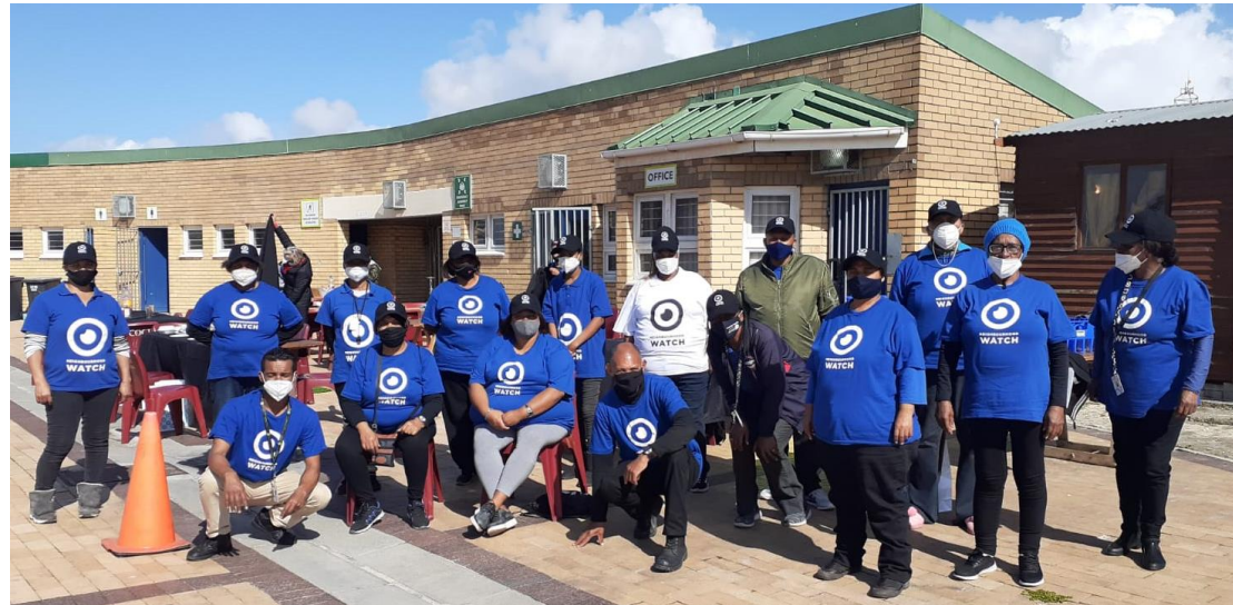
▲ The ECHO NHW was involved in ensuring social distancing at various community events and schools. They also collaborate with other community organisations to distribute food to the children in the community and assist area clean up.