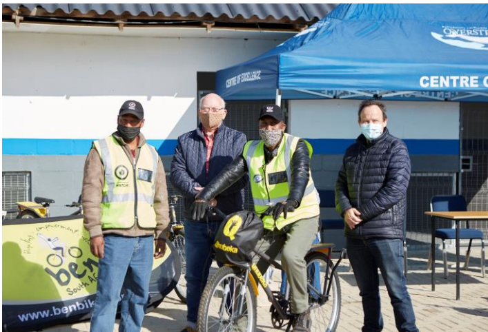
▲ The handover of 10 bicycles to a NHW in the Overstrand Municipality on 14 August 2020.

Over the last few months the Provincial Sustainable Transport Programme (PSTP) of the Western Cape Department of Transport and Public Works (TPW), Department of Community Safety (DOCS) as well as the Bicycle Mobility Consortium made up by the Pedal Power Association (PPA), Bicycle Empowerment Network (BEN) and Qhubeka Charity distributed hundreds of yellow and black bicycles to municipalities, government entities, schools, organisations and DOCS accredited Neighbourhood Watches (NHWs) across the Western Cape.