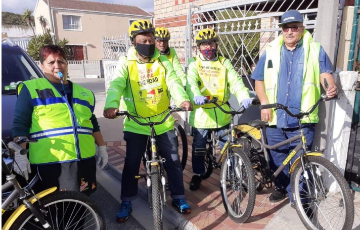
▲ The handover of 5 bicycles to Coot NHW in Mitchell's Plain on 25 June 2020.