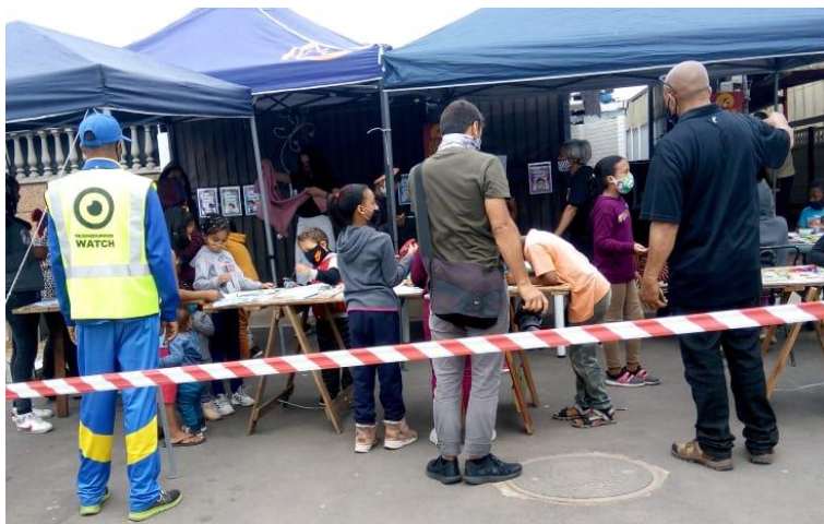
▲ On 10 September 2020 the Bonteheuwel NHW supported the Kurts Foundation as they hosted an Arts and Craft session for the children in Bluegum Street. The foundation whose motto is "be the change", provided entertainment, a warm hearty meal and some sweet treats to over 100 children in the community.