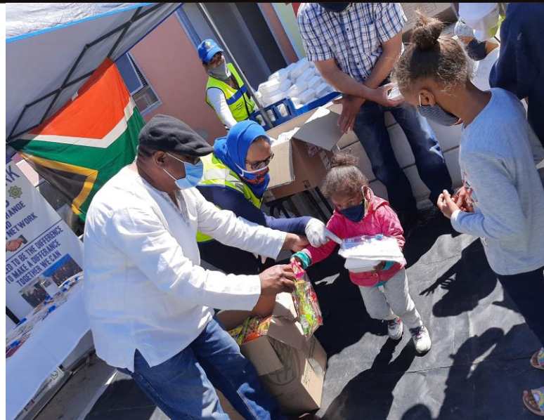
▲ The NHW distributed whistles and treats to children and elderly members of the community.