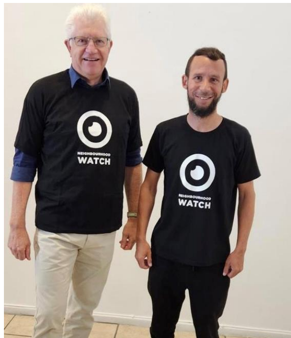
▲ Premier of the Western Cape, Alan Winde and Minister of Police Oversight and Community Safety, Reagen Allen.

"I am delighted to learn that in the Western Cape, we have reached 610 accredited Neighbourhood Watch (NHW) structures. We now have 17 546 registered members. Since taking office, I have patrolled with 41 NHWs across the province, and will be embarking on more of these in due course.